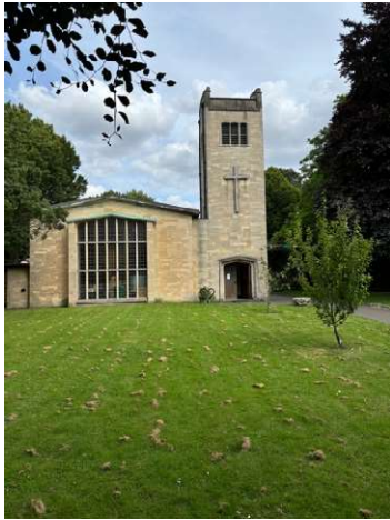
Waddington Church

Friday, 26 July 2024 in 42m (11-1-25 in F#)