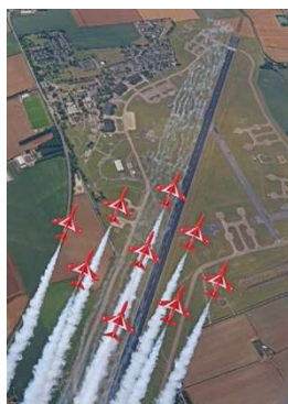
The Red Arrows – their hallmark Diamond 9 formation Over RAF Scampton

Their stay at Scampton was interrupted by a “defence cuts” planned closure of RAF Scampton prompting a move to the south of Lincoln to RAF Cranwell in 1996. A further review led to the resurfacing of the runways at Scampton and a return to their spiritual home in 2000. Further reviews led to the closure of RAF Scampton and after a period of uncertainty – and Lincolnshire public pressure – The final Red Arrows hawk jet took off from RAF Scampton for the short trip to RAF Waddington on 21 st October 2022.