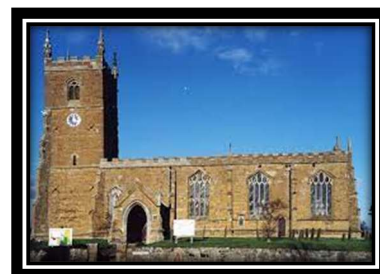
Middle Rasen - (6) – 6-3-13 in G

Tealby stands on the edge of the Lincolnshire Wolds and a walk in the churchyard reveals Lincoln Cathedral standing proudly on the horizon some 20 miles away.