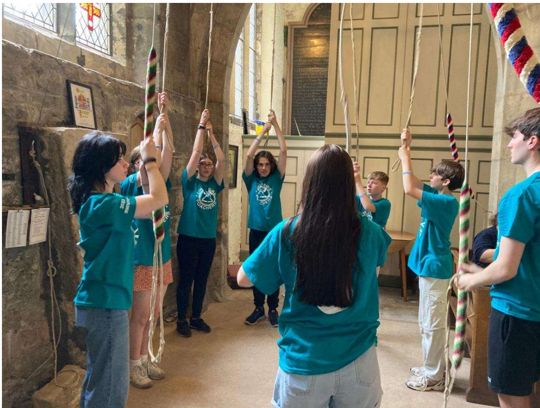
The Poachers ringing at All Saints, North Street