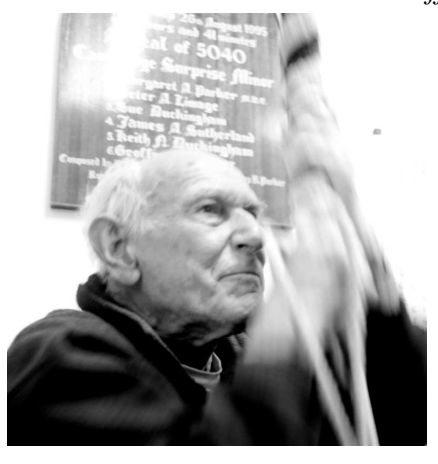
Bless him! 89 and still ringing.