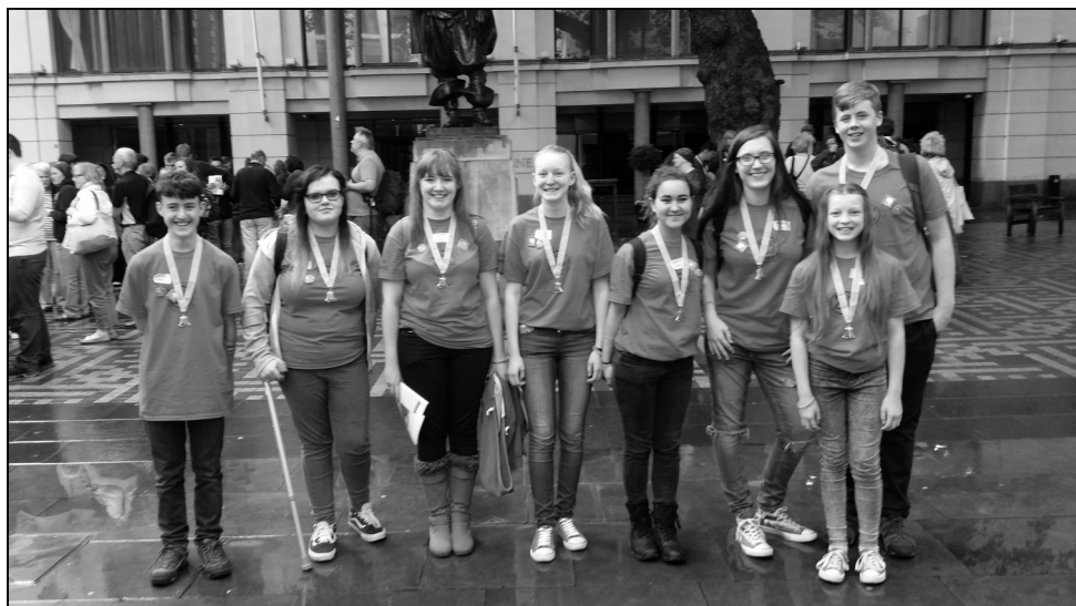
The Lincolnshire Poachers!